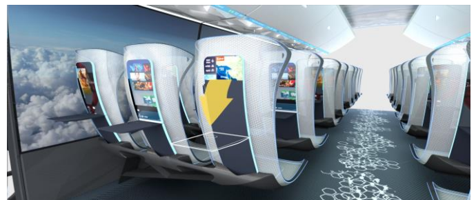
Large screens and intelligent surfaces offer a multimedia experience: the entire backrest is transformed into a screen that can be connected to the passenger's own device, if so desired, and can also play smartphone apps from third-party providers.

FACC AG caused quite a sensation at the international aviation trade fair AIX with the revamping of aircraft interiors. When creating the BIOS FUTURE CABIN, the main focus was placed on the needs of passengers and the use of sustainable materials. The company has opted for a resin derived from sugar cane, which has been optimized for use in aviation through intensive research work. The result: 20% more room to move and 50% more storage space compared to current-generation aircraft. This was made possible by a design approach that integrates seamlessly with the load-bearing elements of the aircraft. A 100% wheelchair-accessible cabin and a disability-friendly lavatory are also setting new standards with respect to barrier-free flying.